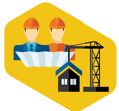
Professionals from the AECOM sector in Angola