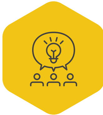
Contracting Public Entities